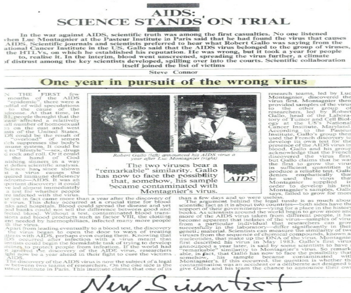
Figure 2: Article from the New Scientist on the 'Lost Year'.

In support of Gallo's claim for HTLV, Weiss blocked publication of the French paper. As can be seen in Referee 1 ( Figure 1 ) he wrote: "Gallo's laboratory spent almost 2 years carefully characterizing HTLV before they ventured into print, had the data been as rudimentary as for the Paris virus, no-one would have taken the finding seriously". Rejection of the French manuscript significantly delayed its evidence becoming generally known, sufficiently for the journal New Scientist later to publish a major article entitled "AIDS: Science Stands On Trial One Year in Pursuit of the Wrong Virus" ( Figure 2 ) [14]. In that article Gallo is blamed for the lost year, but Weiss' role was in truth pivotal.